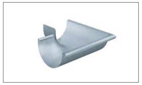
Miter Seamless, inside and outside