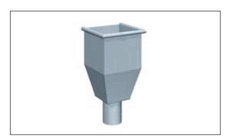
Leader Head, square