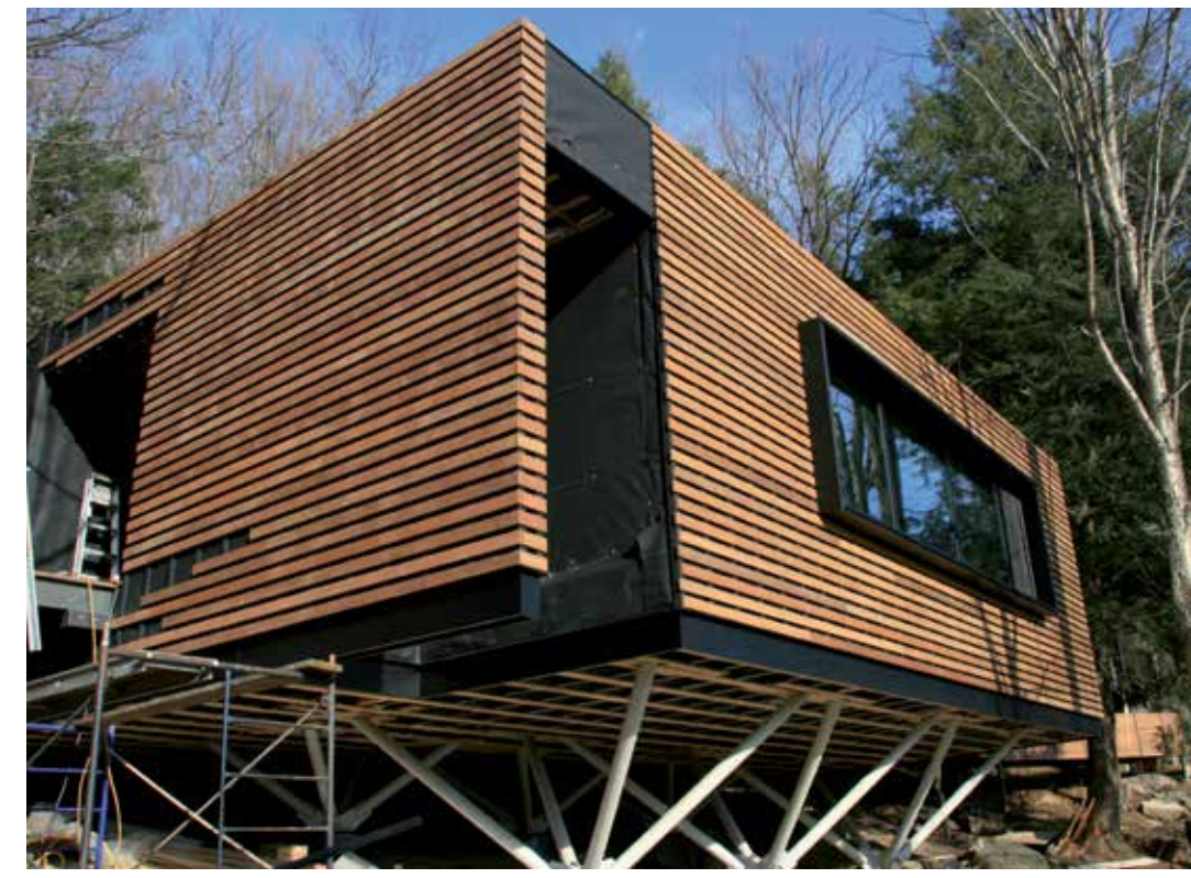
Balnea Réserve Thermale - Bromount-sur-le-lac, Quebec