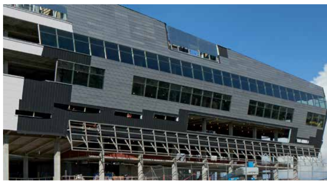
Collaborative Life Sciences Building - Portland, Oregon